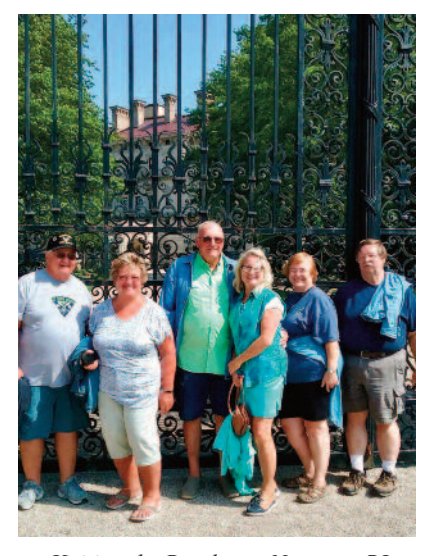
Visiting the Breakers - Newport, RI