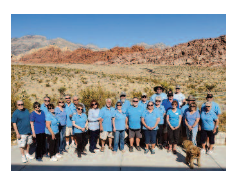
Discovery California visits Red Rock Canyon National Park