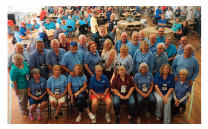
Blue Ridge Discoverys

A handful of Blue Ridge coaches will be in Webster Florida again this year, and will attend the Southeast Rally in Seffner. Hope to see many of you in Florida. Safe travels to all. ❖