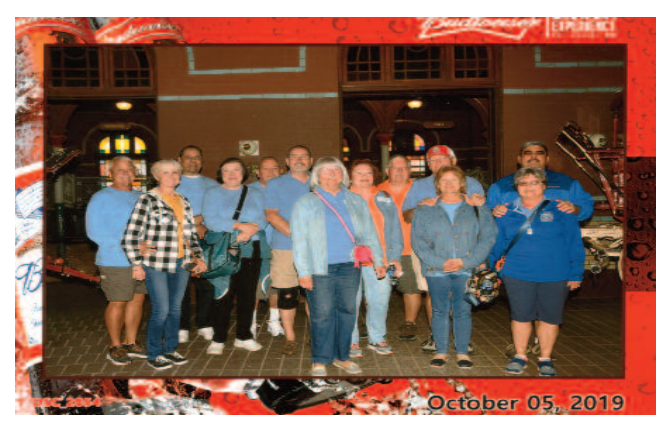
St. Louis Budweiser Tour