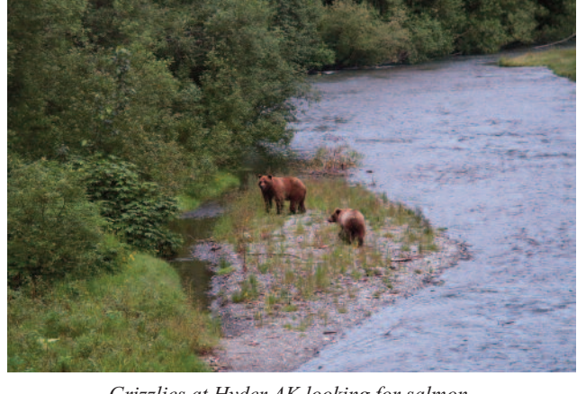
Grizzlies at Hyder AK looking for salmon