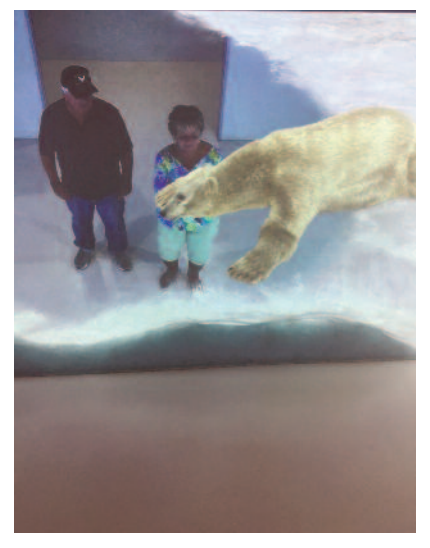
Polar Bear Encounter at Mystic Aquarium

We look forward to another year traveling our country in our Discoverys. How fortunate we are to be able to do this. Make it a point to go to DOAI or chapter rallies in 2020, and you'll be glad you did. See you down the road, safe travels, Happy Holidays to all! ❖