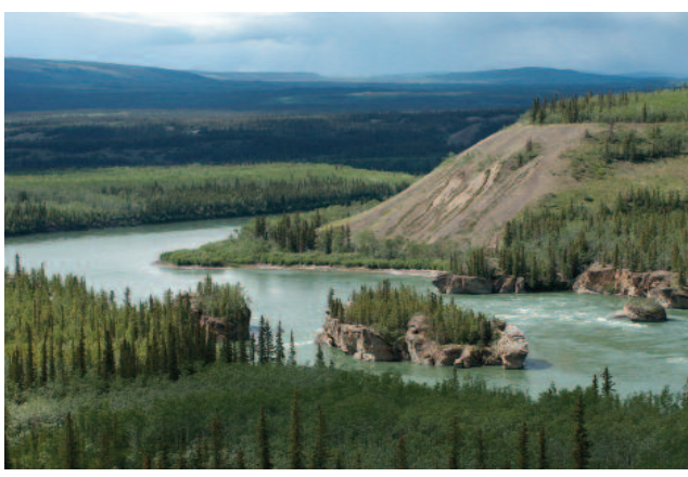
Stewart River YT Canada