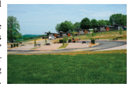
Side view from the balcony of the Rally Hall

5th of October should you desire to stay over several days. A reminder – you will not be able to arrive before 12 noon and any early or late days must be noted and paid for on the registration form. Amenities at The Ridge include a Zero Entry Pool, "Bark Park," fitness Center and Pickle Ball. Cabins and outdoor pavilions are available. Pigeon Forge and Gatlinburg offer numerous attractions, dining and entertainment. Other information will be provided as it becomes available. ❖