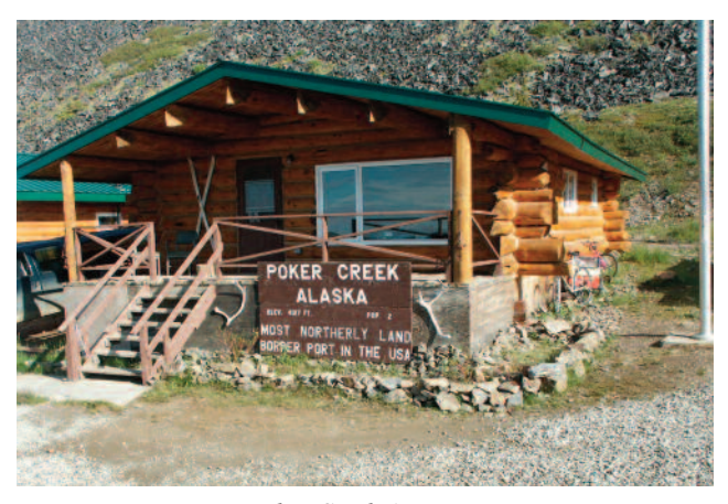
Poker Creek AK entry