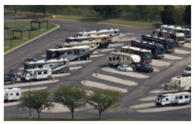
Casino Queen