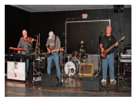
Devil Goes Down To Georgia -Trip Wire Style