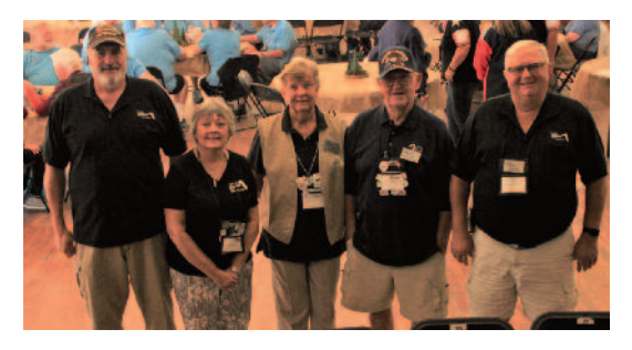
Florida Discovery Sunshiners

The next rally for the Florida Discovery Sunshiners is in Bushnell, Florida, in December at the Paradise Lake Resort where they will celebrate Christmas. Fourteen Discovery owners have reserved their spots. Regards and happy camping. •