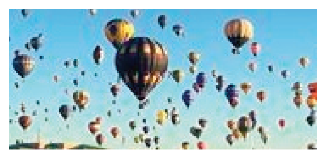
Albuquerque Balloon Fiesta 2017

After leaving Albuquerque, we drove off to Mesilla with a stop in Hatch to try the world famous Chili at Sparky's for lunch. Hatch is the Napa Valley of Chili. But alas, Sparky's was closed. Spent a couple of days Mesilla/Las Cruces area enjoying the charm of Old Town before heading off to the Wild West ghost town of Tombstone. The Tombstone stop was an adventure everyone still with us thoroughly enjoyed from the shootouts on the streets of Tombstone, chicken dinner at the Longhorn Restaurant, and the Bisbee cooper mine tours.