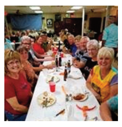
Enjoying Oktoberfest dinner at the Elks Lodge in Wickenberg

The last stop on the Rolling Rally was Wickenburg, Az. We stayed at the Horspitality RV Park who were great hosts. They even provided the group with a pancake breakfast. The RV park caters to those traveling with horses but they didn't mind that we didn't bring any horses only a few dogs and a couple of cats. We had two dinners that were hosted by the local Elks, including an Octoberfest dinner.