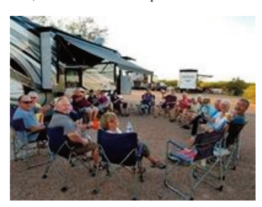
Happy Hour in Tombstone, AZ

After leaving Albuquerque, we drove off to Mesilla with a stop in Hatch to try the world famous Chili at Sparky's for lunch. Hatch is the Napa Valley of Chili. But alas, Sparky's was closed. Spent a couple of days Mesilla/Las Cruces area enjoying the charm of Old Town before heading off to the Wild West ghost town of Tombstone. The Tombstone stop was an adventure everyone still with us thoroughly enjoyed from the shootouts on the streets of Tombstone, chicken dinner at the Longhorn Restaurant, and the Bisbee cooper mine tours.