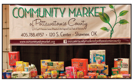
Sharing with others