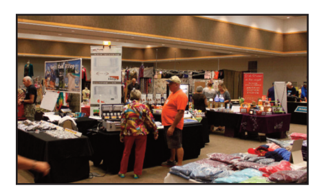
A grand variety of vendors