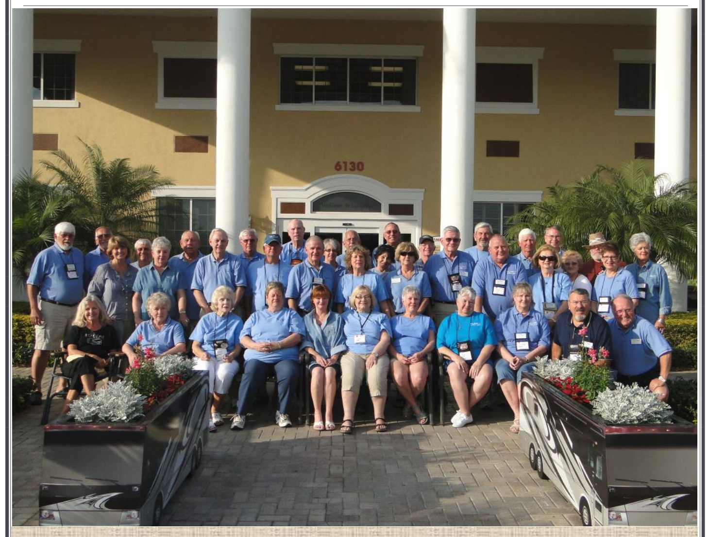
Blue Ridge meeting, Lazy Days, Seffner, Florida 29 January 2013