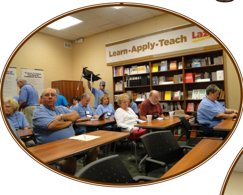
Blue Ridge Discoverys - members