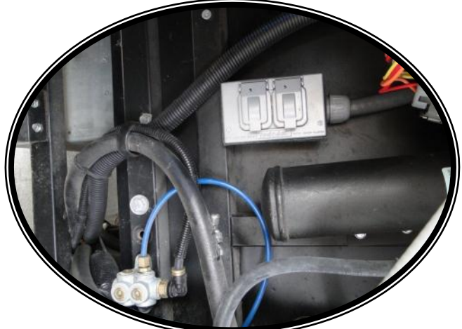
Weatherproof Plug on Firewall