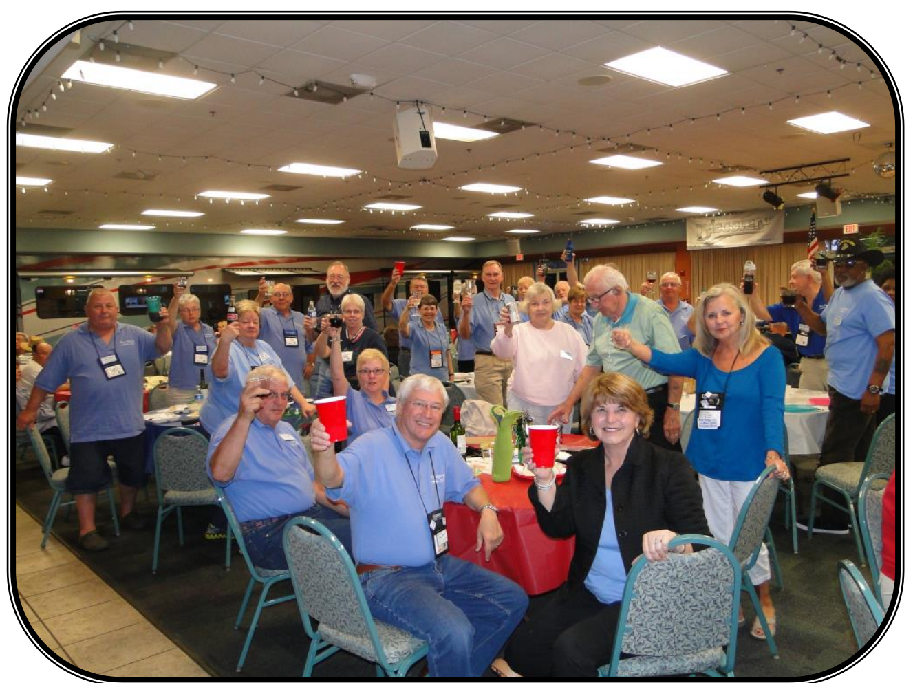
28 January 2014

A toast to our fellow travelers that were unable to join us.