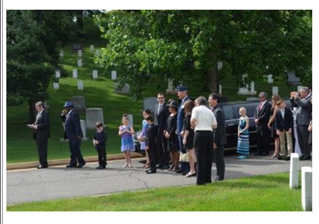
Mourners gathered to follow the caisson to the grave site