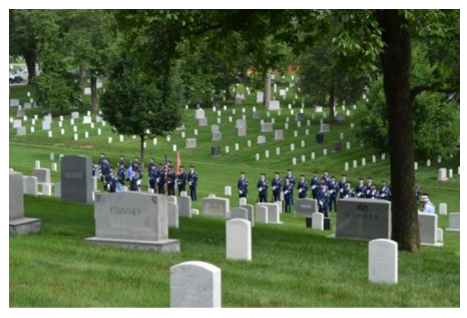
The Band, Color Guard, and Honor Guard