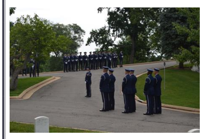
Funeral Detail with Honor Guard in background