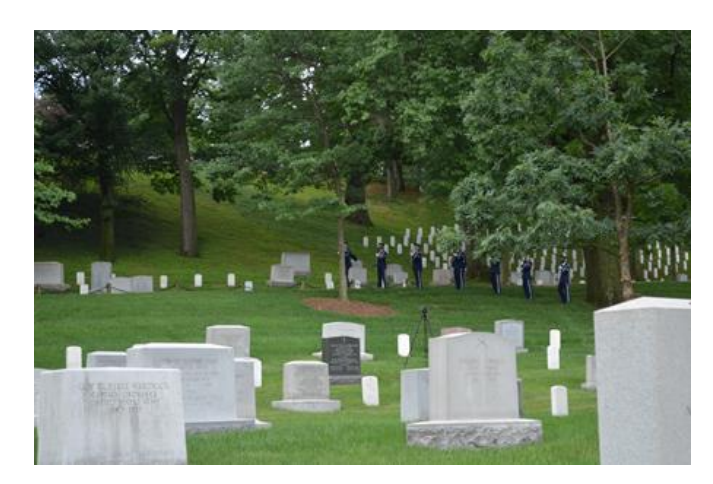
Firing Squad's 21 gun salute