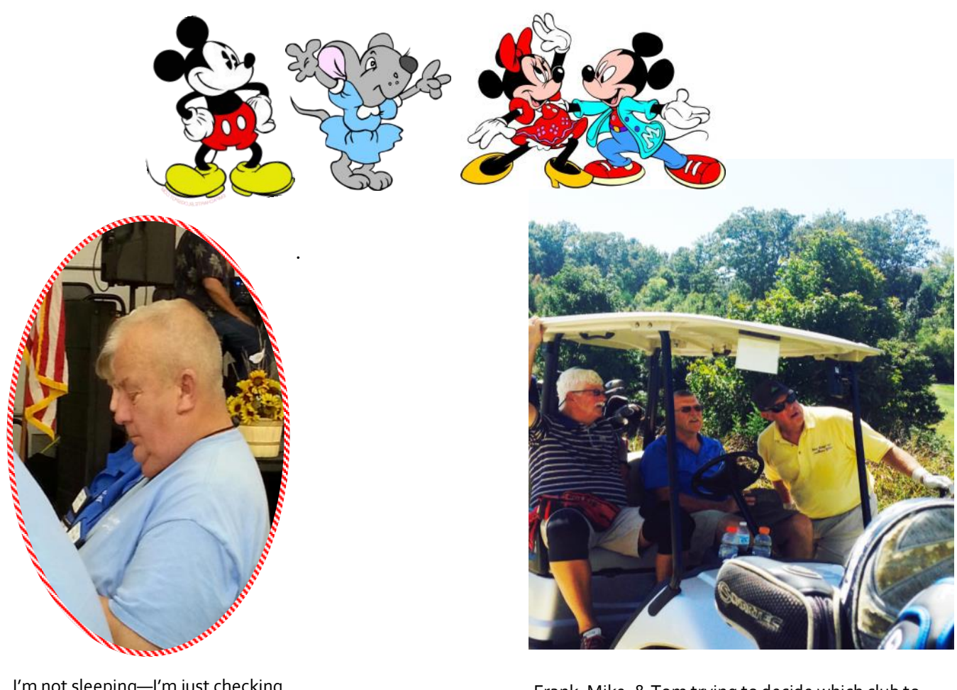
I'm not sleeping—I'm just checking my eyelids for holes! Amana, Iowa