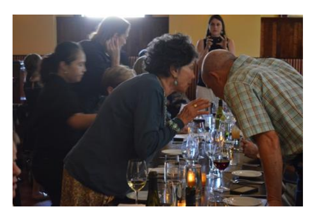
Not telling secrets \mbox{ - It got very loud!}