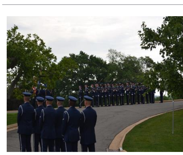
Procession was led by the Band and Colorguard