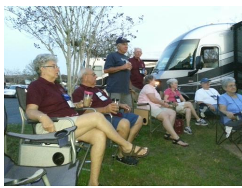
Page 1 of 6