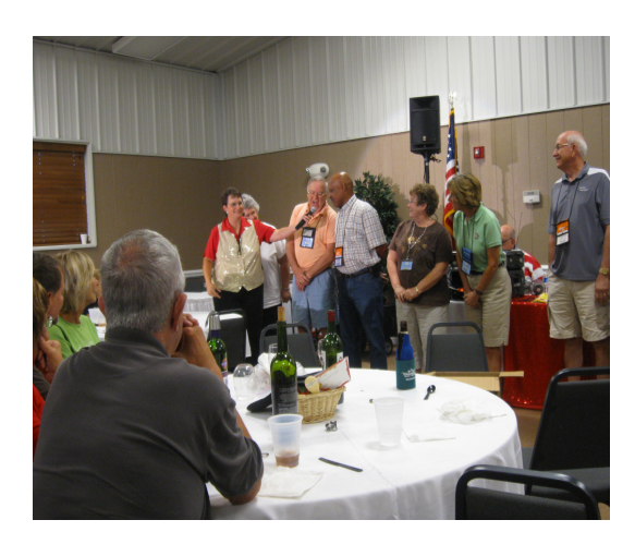
Some of our entertainment